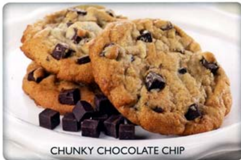
CHUNKY CHOCOLATE CHIP

Keeps six months in the freezer or three months in the refrigerator, so stock up for parties and holidays!