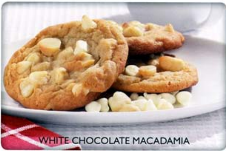
WHITE CHOCOLATE MACADAMIA