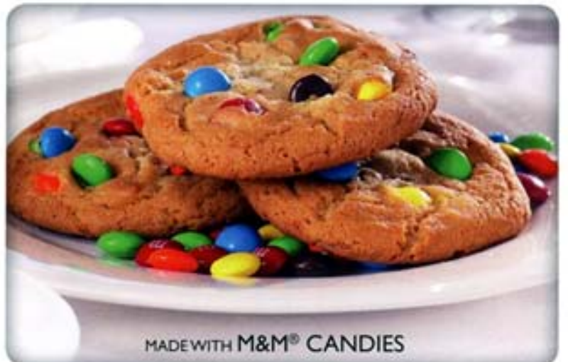
MADE WITH M&M ® CANDIES