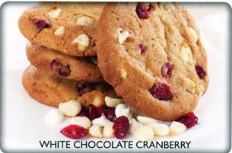
WHITE CHOCOLATE CRANBERRY