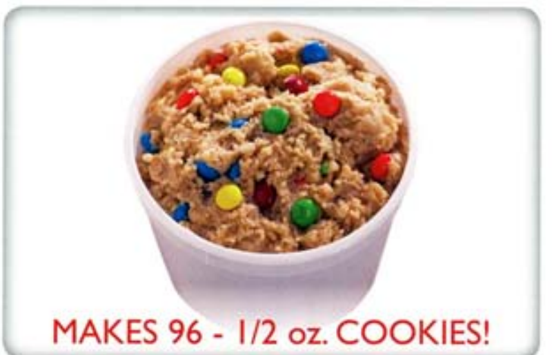
MAKES 96 - 1/2 oz. COOKIES!