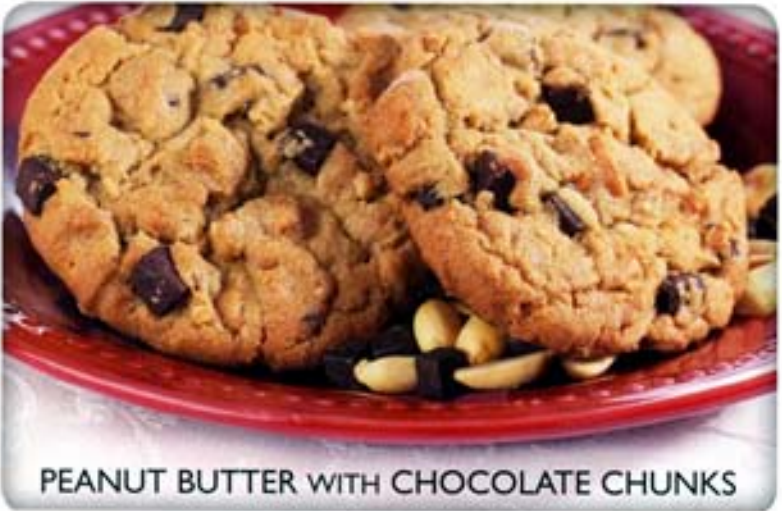
PEANUT BUTTER WITH CHOCOLATE CHUNKS